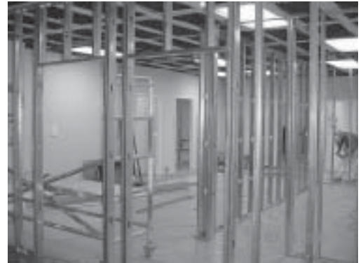
Despite the economy, with careful budgeting and your support we were able to move into a new building in June, 2003.