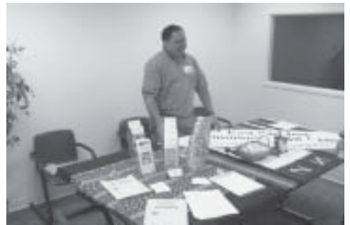
One of the many offerings at Kelley Park Center is legal services.