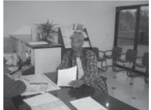
A client receives help in his job search efforts.