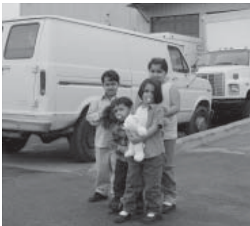
Your generosity helps those in need.