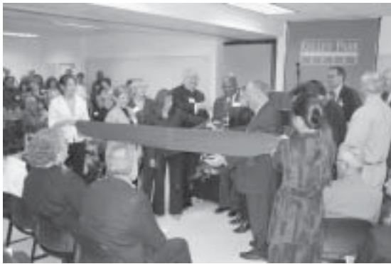
The Ribbon Cutting: The quality and diversity of the leaders present that day speak to the kind of leadership we have in San Jose.

The primary movers of this collaborative effort are the Vincentian followers of St. Vincent de Paul. In the cholera-ravaged slums of Paris in 1835, it was a Daughter of Charity, Sister Rosalie, who enlisted the support of a young student of the law, Frederic, and together they initiated the Society's efforts in serving the poorest of the poor. The agencies who reside within this new facility are all direct outgrowths of the Daughters of Charity and Saint Vincent.